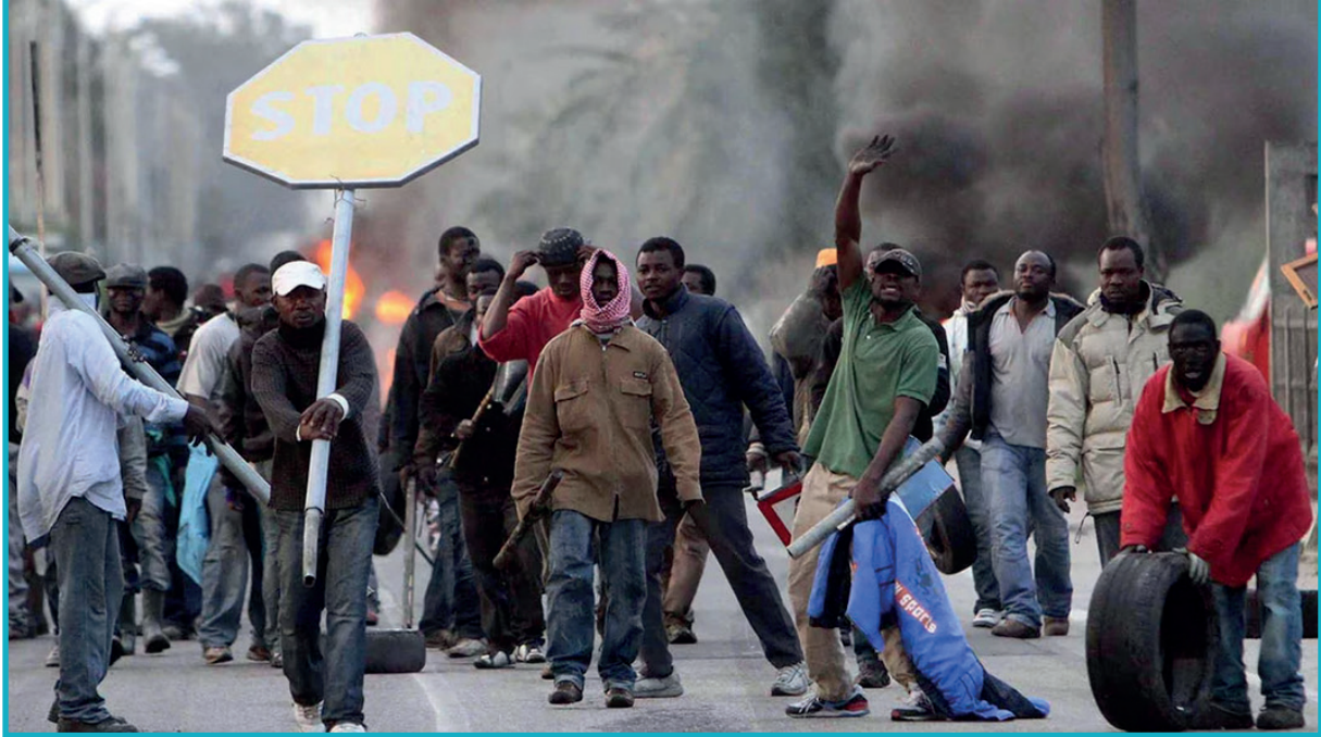
Scenes of revolt from Rosarno