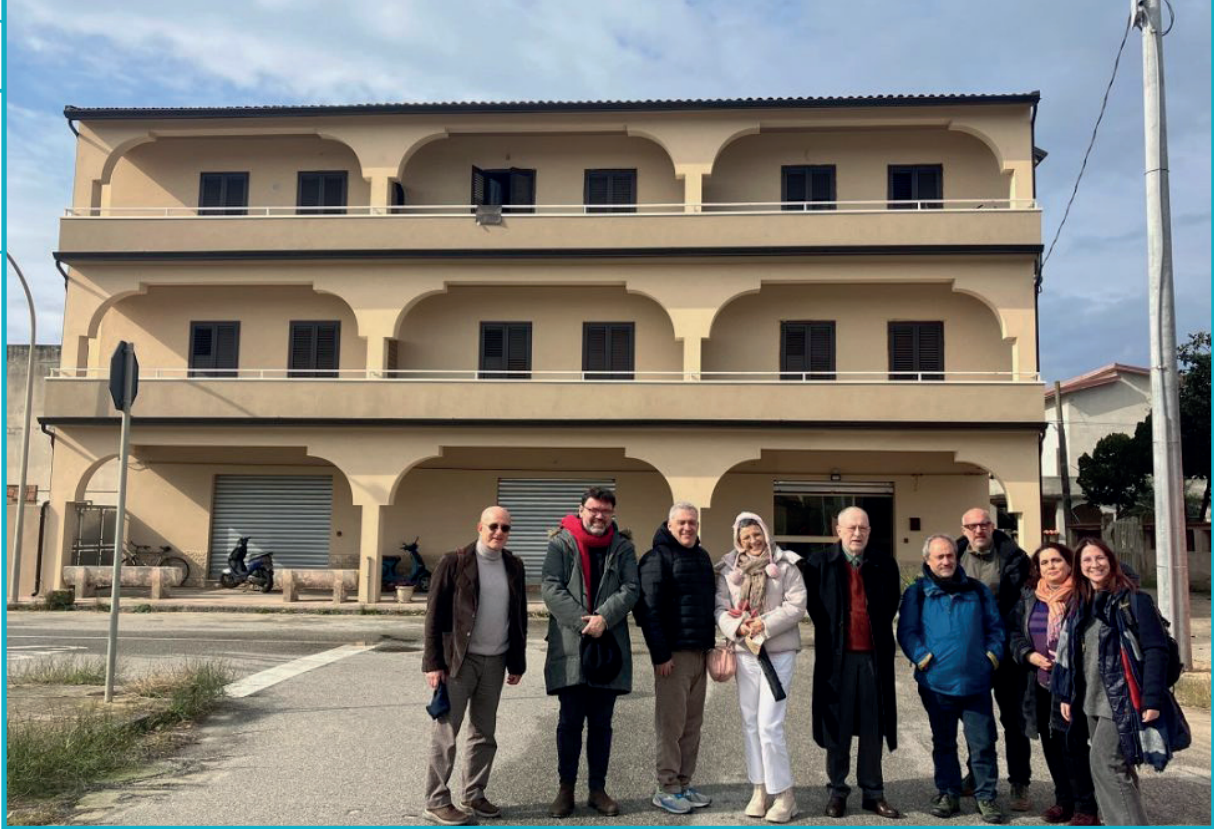
The Dambe So Hostel – from: Italia che cambia; 30/05/2023

The institutional response reflects this perspective. After three days of clashes, the central government instructs law enforcement to evacuate the sub-Saharan migrants from the area. The workers are gathered onto buses and taken to the capital, where they are left at the station without any support, without a place to shelter, or means to sustain themselves 8 .