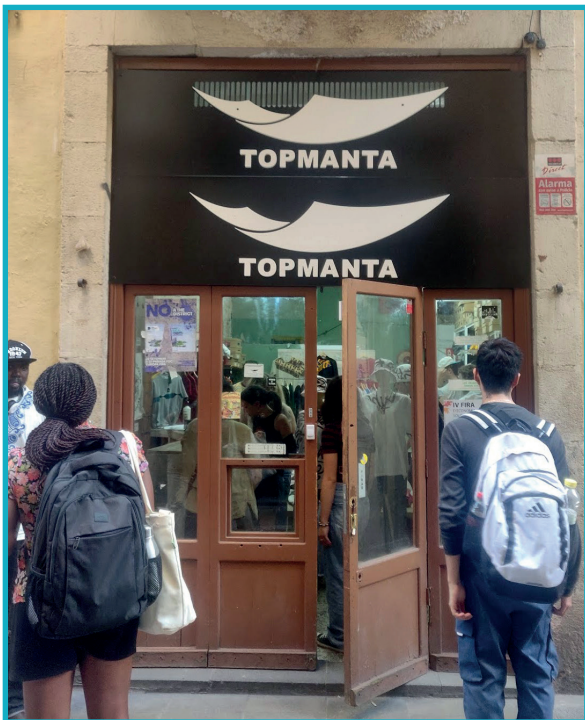
Top Manta shop